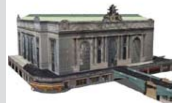
Grand Central Terminal