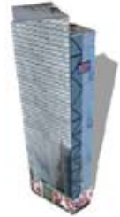
Times Square Tower