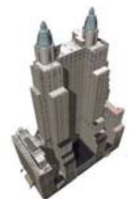
Waldorf Astoria Hotel