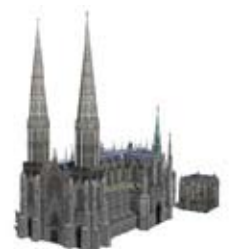
St. Patrick's Cathedral